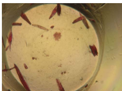
© 2005 International Union of Crystallography All rights reserved

The best characterized corrinoid protein from M. thermoacetica is the CFeSP and, as discussed above, it transfers the methyl group of methyltetrahydrofolate to the CODH/ACS. It is an \alpha\beta dimer having two subunits of 33 and 55 kDa. The smaller subunit carries the corrinoid 5-methoxybenzimidazolylcobamide, whereas the larger subunit contains the [4Fe-4S] cluster (Ragsdale et al. , 1987; Lu et al. , 1993). A second corrinoid protein designated MtvC (Naidu & Ragsdale, 2001) is part of a three-component vanillate O -demethylase system. This enzyme system may have a broad specificity and be involved in the transfer of methyl groups from a number of methoxylated aromatic compounds functioning as methyl donors (Daniel et al. , 1991). A similar system has been described for the acetogen Acetobacterium dehalogenans (Kaufmann et al. , 1998; Engelmann et al. , 2001). A third corrinoid protein of 27 kDa has also been purified from M. thermoacetica , but its function has not been ascertained (Ljungdahl et al. , 1973; Ragsdale et al. , 1987).